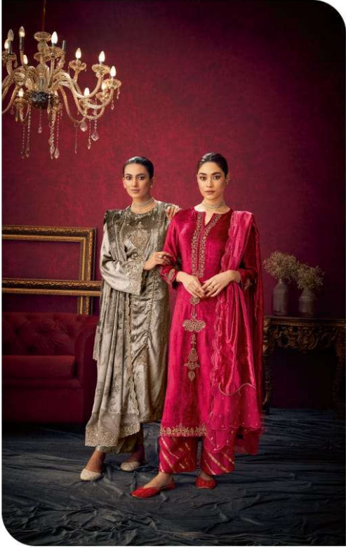
Velvet Edition PARIZAD