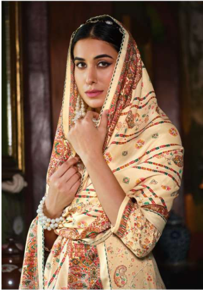
THE WORLDCHARMER | 522-001

EVERY THREAD HAS BEEN CHOSEN WITH MINDFUL CARE. THE GREATEST PRECISION HAS ENSURED WHEN CREATING A DESIGN WHICH YOU WOULD LIVE UP TO HER BECAUSE IT IS DESIGNED TO FULFILL HER BEAUTY.