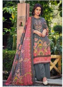
• 781-008 •