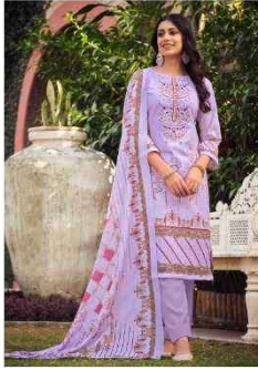
• 781-001 •