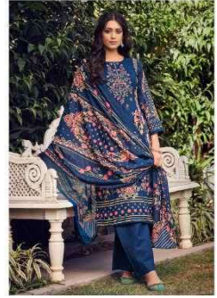
• 781-004 •