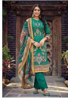
• 781-007 •