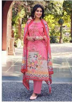
• 781-006 •