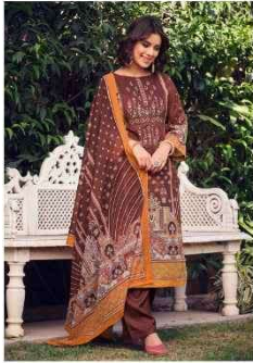
• 781-005 •