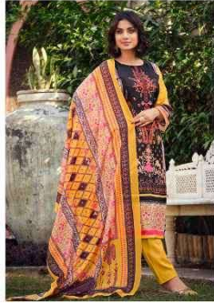
• 781-002 •