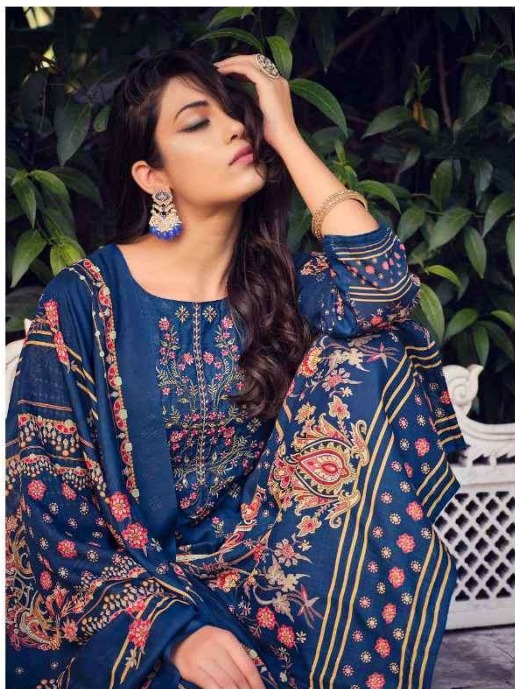
• ADD AN ELEMENT OF DESIGN FOR GOTH-CHIC • 781-004