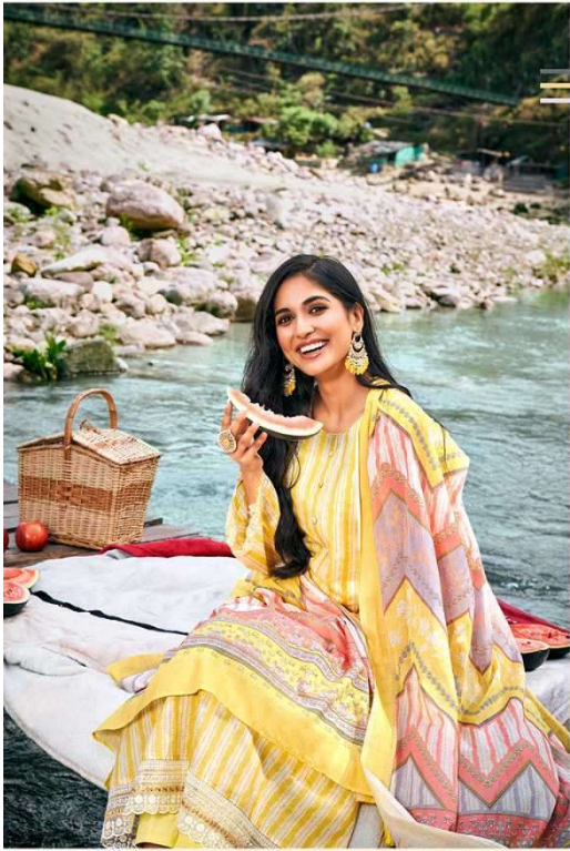
D.NO. 1002 DREAMY DRAPES