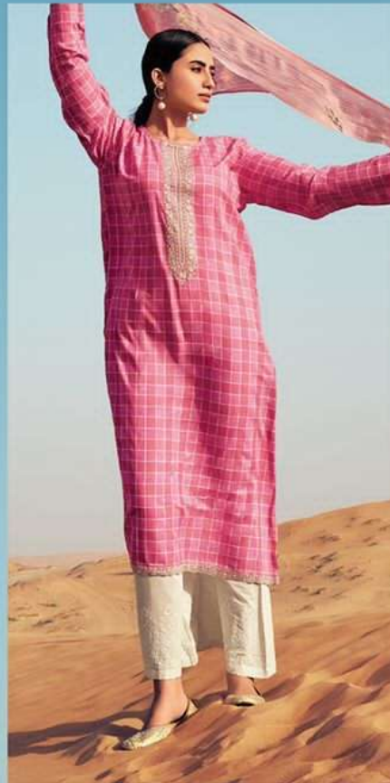
M K = 0 4