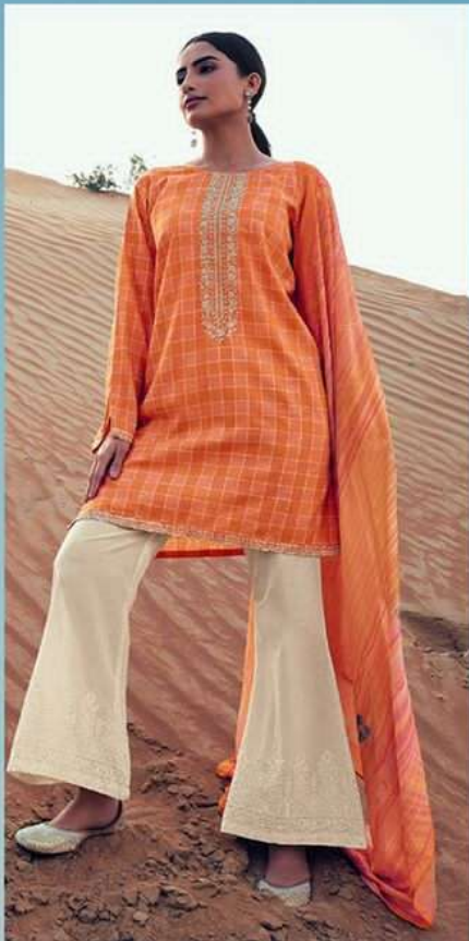
M K = 0 3