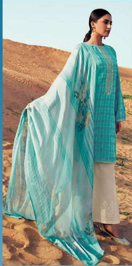
M K = 0 2