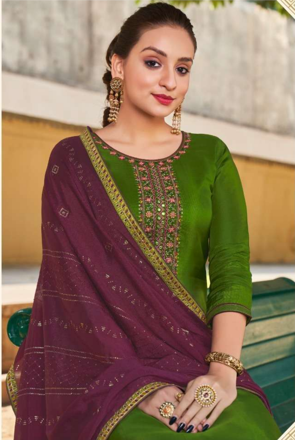
A BREATH TAKING ARRAY OF FINE DETAILING & INTRICATE DESIGN INSPIRED BY INDIAN CULTURE