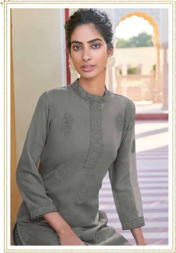
C-L-A-S-S-Y Elegant and contemporary in style, this kurta is a perfect choice for a sophisticated look. 19026