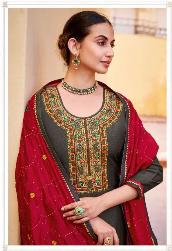
FREE — 3352 — SPIRIT