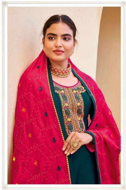
GLAM — 3354 — DIVA