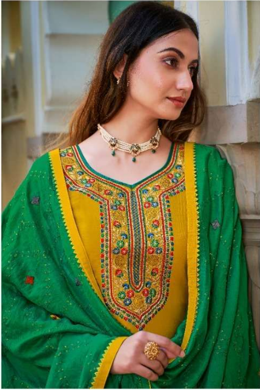
GLAM — 3351 — DIVA