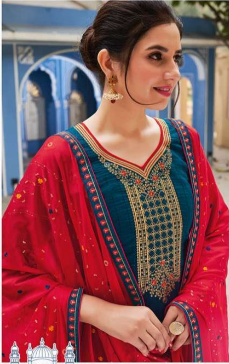
THE ESSENCE OF GREAT FASHION 3521