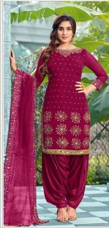
* 2027 *