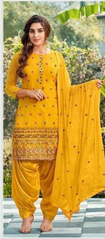
* 2026 *