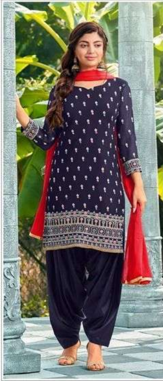
* 2025 *