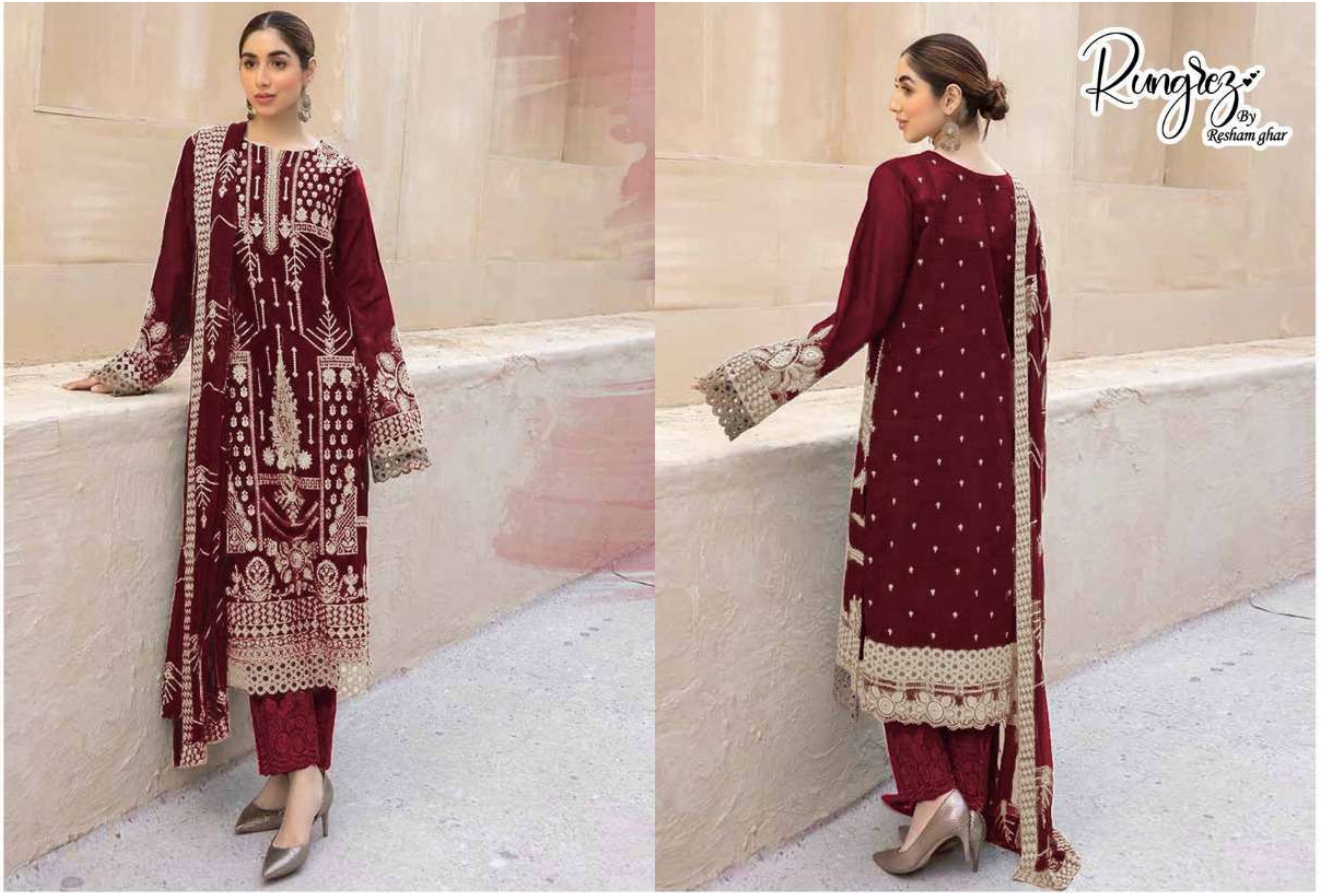
TOP : HEAVY EMBROIDERY WITH STONE WORK BOTTOM : SANTOON WITH EMBROIDERY PATCH DUPATTA : HEAVY EMBROIDERY WORK WITH LACE WORK