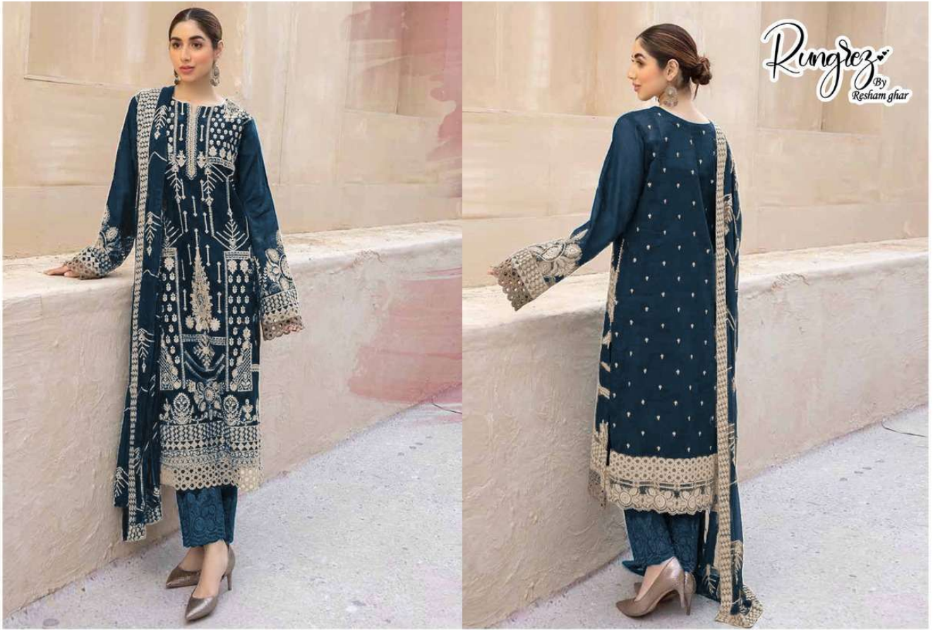
TOP : HEAVY EMBROIDERY WITH STONE WORK BOTTOM : SANTOON WITH EMBROIDERY PATCH DUPATTA : HEAVY EMBROIDERY WORK WITH LACE WORK