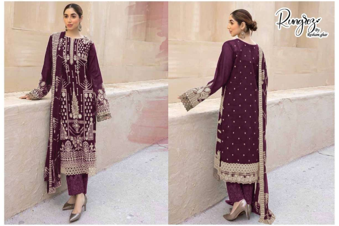
TOP : HEAVY EMBROIDERY WITH STONE WORK BOTTOM : SANTOON WITH EMBROIDERY PATCH DUPATTA : HEAVY EMBROIDERY WORK WITH LACE WORK