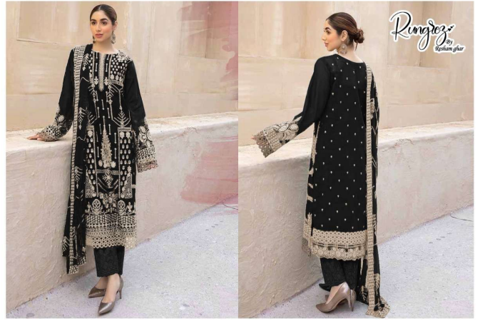
TOP : HEAVY EMBROIDERY WITH STONE WORK BOTTOM : SANTOON WITH EMBROIDERY PATCH DUPATTA : HEAVY EMBROIDERY WORK WITH LACE WORK