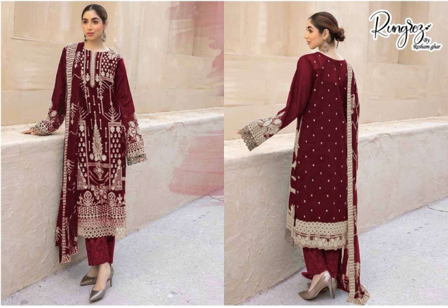
TOP : HEAVY EMBROIDERY WITH STONE WORK BOTTOM : SANTOON WITH EMBROIDERY PATCH DUPATTA : HEAVY EMBROIDERY WORK WITH LACE WORK