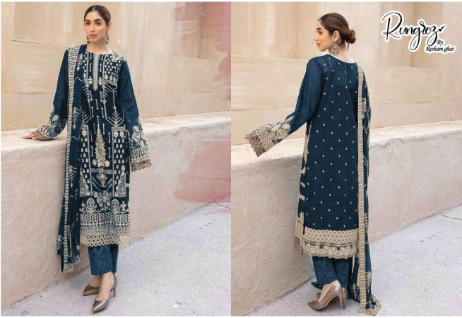
TOP : HEAVY EMBROIDERY WITH STONE WORK BOTTOM : SANTOON WITH EMBROIDERY PATCH DUPATTA : HEAVY EMBROIDERY WORK WITH LACE WORK