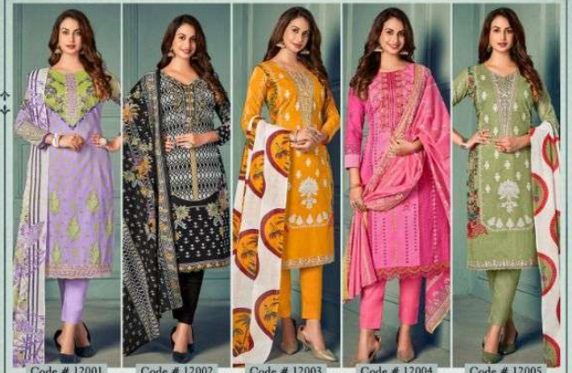
Code # 12001