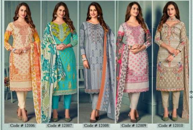
Code # 12006