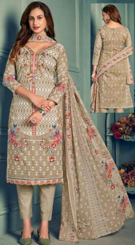
Code # 12010