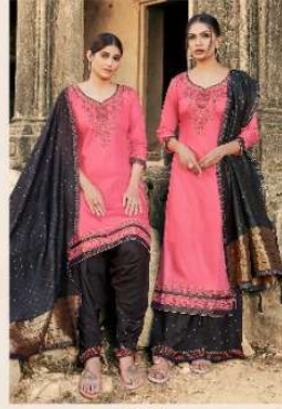
D.No :- 5755