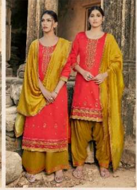
D.No :- 5756