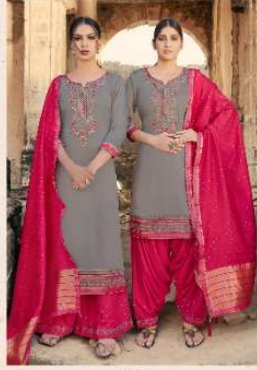
D.No :- 5752