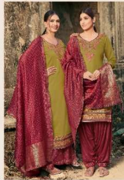
D.No :- 5757