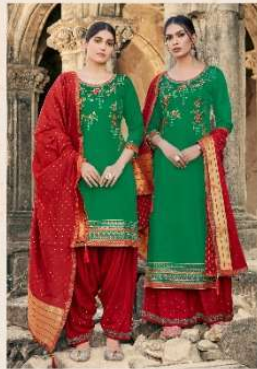
D.No :- 5754