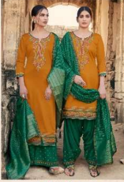
D.No :- 5751