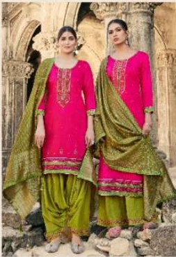
D.No :- 5753