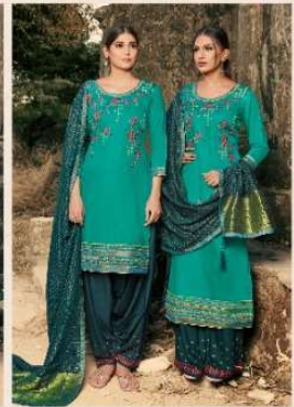
D.No :- 5758