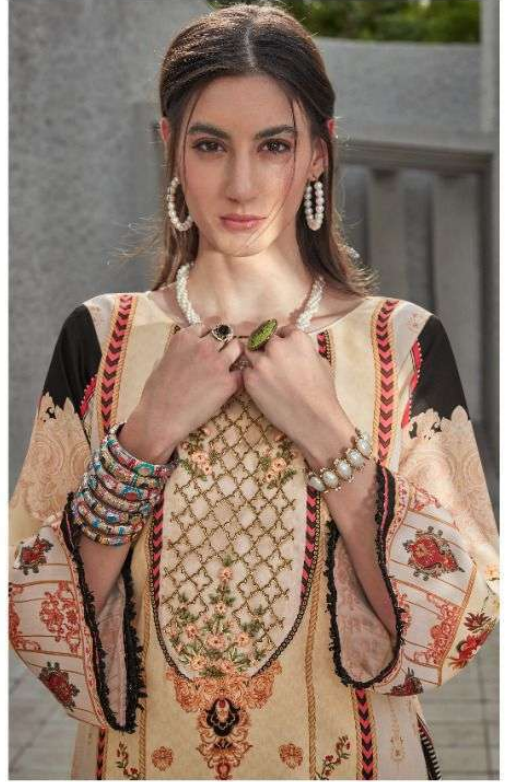
Copyright reserved for all rights with the designer of this page and its contents. For more information contact the designer at the address below.