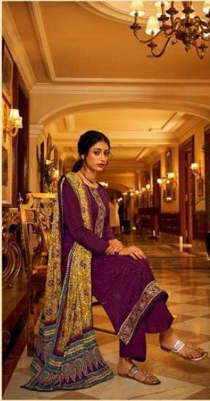
ELEGANT/SPLASH OF STYLE WITH ETHNIC TOUCH PATOLA#872