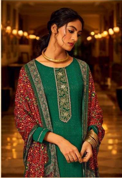
FABULOUS/ELEGANT FLORAL DIGITAL PRINTS PATOLA-871