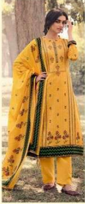
• 1003 •