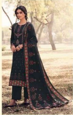
• 1005 •