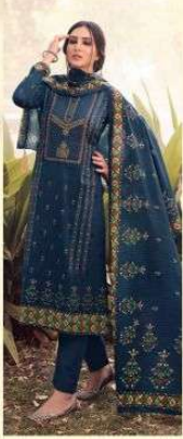
• 1002 •