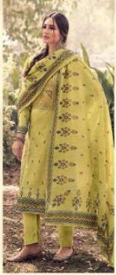
• 1001 •