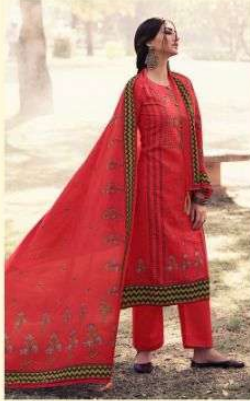
• 1004 •