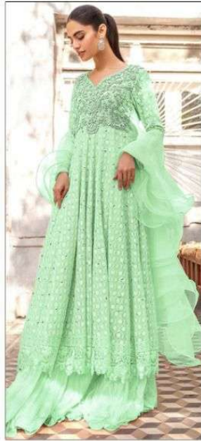
D.NO S- 47 B