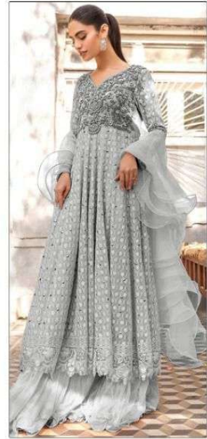
D.NO S- 47 D