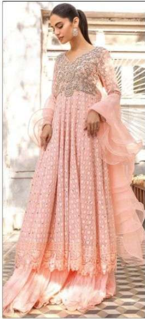
D.NO S- 47 A

TOP - FOX GEORGETT WITH EMBROIDERY & HANDWORK DUPATTA - NET WITH FRILL & MOTI WORK INNER / BOTTOM - SANTOON