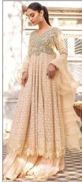
D.NO S- 47 C