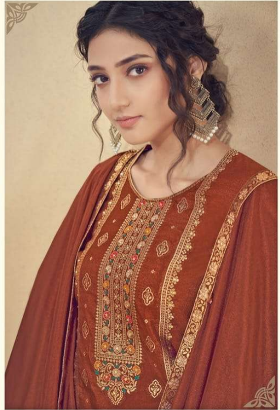
EFFORTLESS CALIBRE OF CREATIVITY WHICH FEATURES THE BEAUTY IN A PERSON WITH BEAUTIFUL GARMENT.