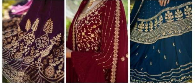
Our elegant collection and fashion patterns, define true quintessence.