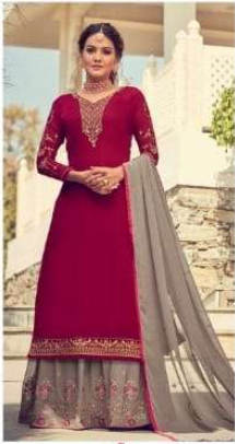
CODE \ 7304