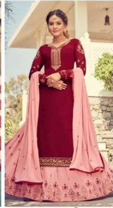
CODE \ 7302