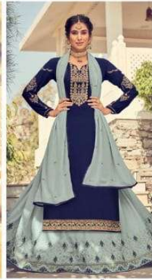
CODE \ 7305