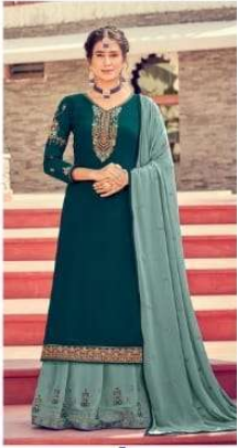
CODE \ 7301