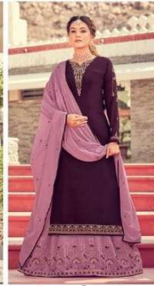
CODE \ 7306