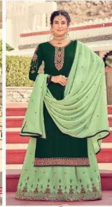
CODE \ 7303