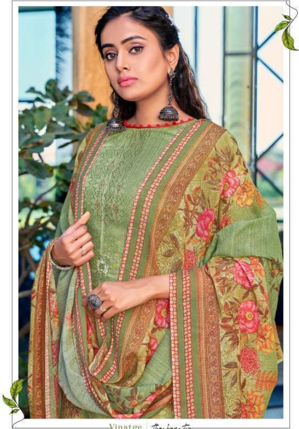
Vinatge the beauty A SHAMBOUR BRAND FASHION WHICH IS AN ART TO D.NO 2008