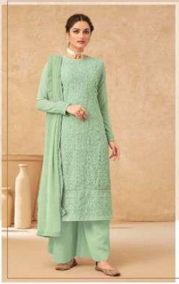
-: 41014 :-