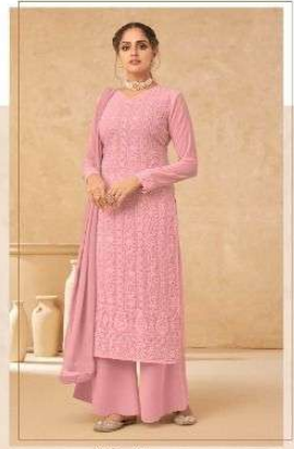
-: 41016 :-