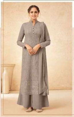
-: 41012 :-