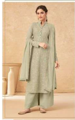
-: 41015 :-