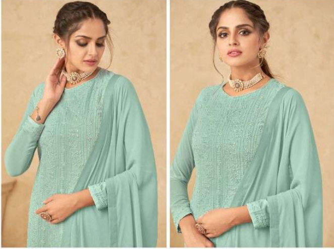
Fashion is not something that exists in dresses only. Fashion is in the sky, in the street. Fashion has to do with ideas, the way we live, what is happening.