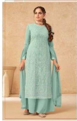
-: 41017 :-