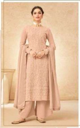
-: 41013 :-