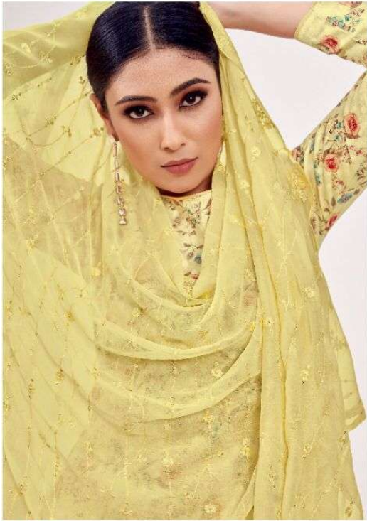
THE NEW ARRIVAL S6006