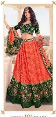
..... 104 .....