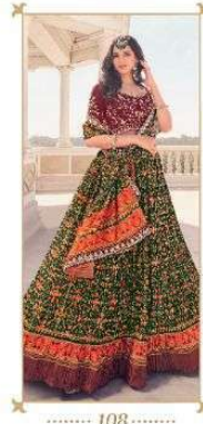
..... 108 .....