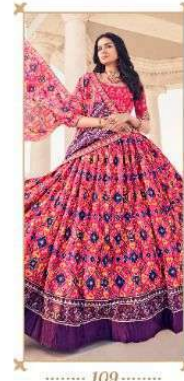
..... 109 .....