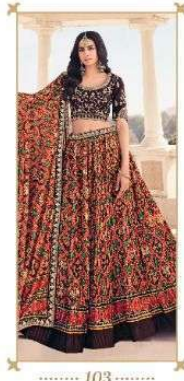
..... 103 .....