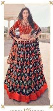
..... 105 .....