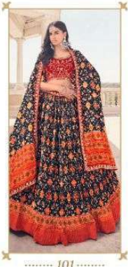
..... 101 .....