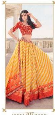
..... 107 .....