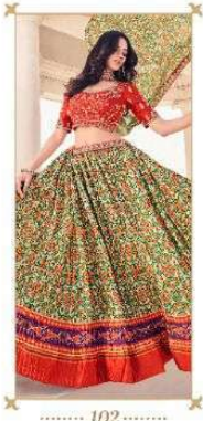
..... 102 .....