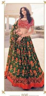
..... 106 .....