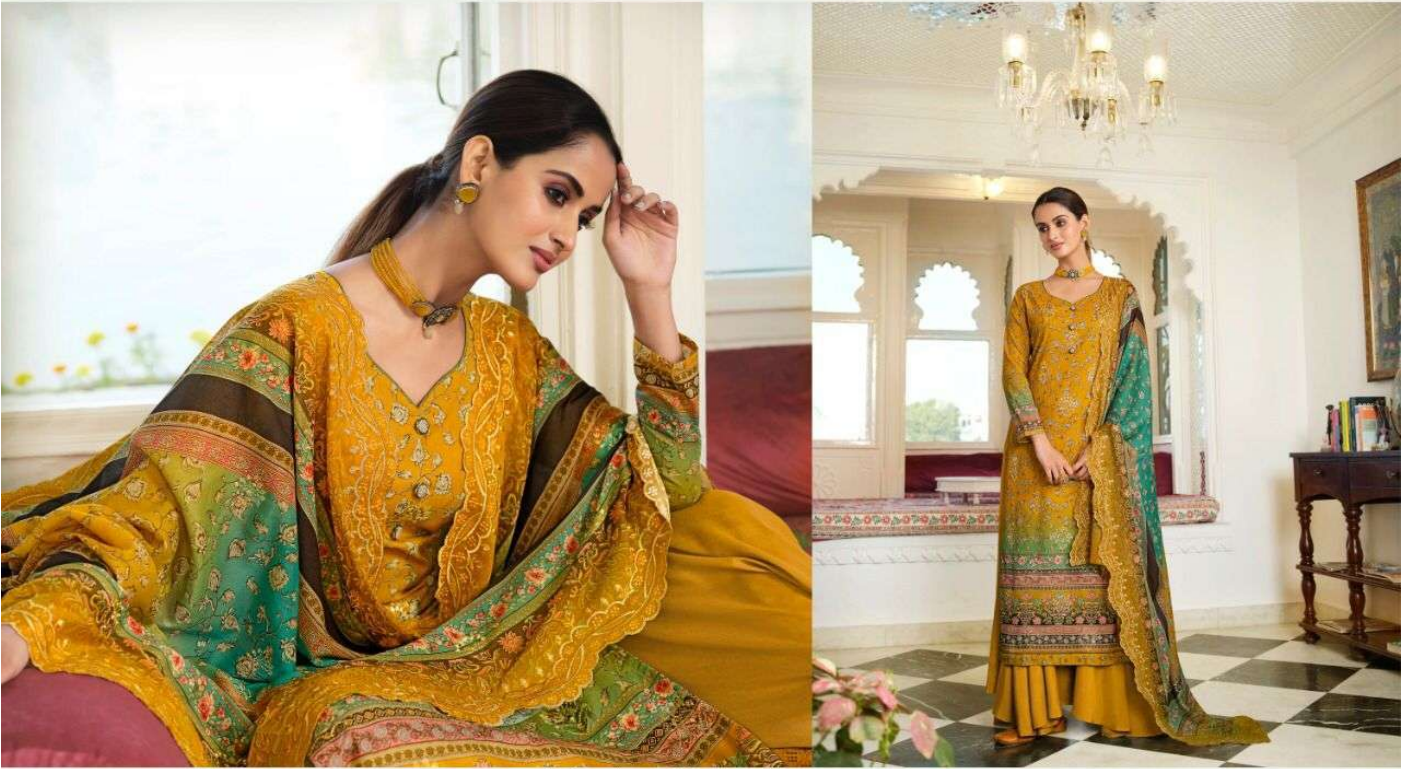
* 5203 *