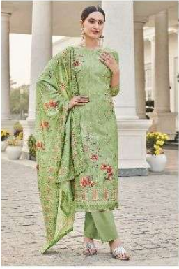
D. NO. 71005