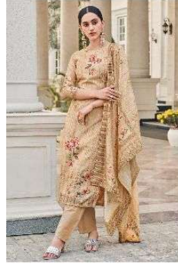
D. NO. 71003