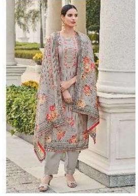
D. NO. 71004