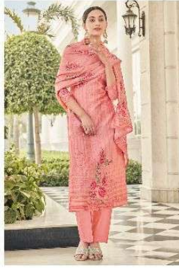
D. NO. 71006