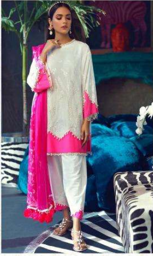
D.N 1001 NX