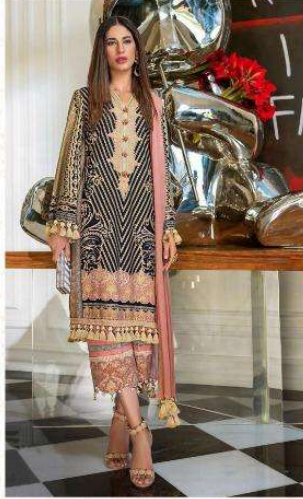
D.N 1002 NX