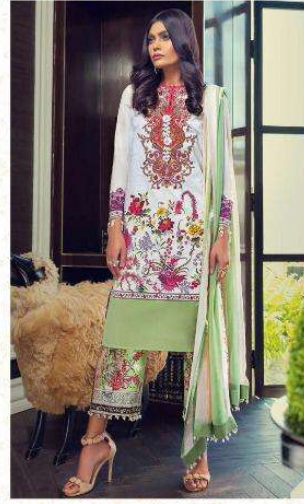
D.N 1003 NX