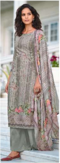
◆ 3101 ◆