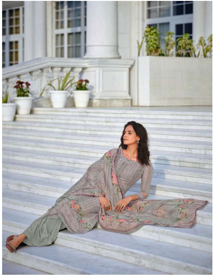
THE CELEBRATION OF ETHEREAL ETHNICITY