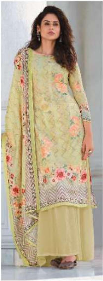
◆ 3102 ◆