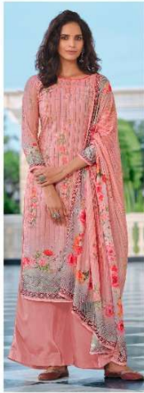
◆ 3103 ◆