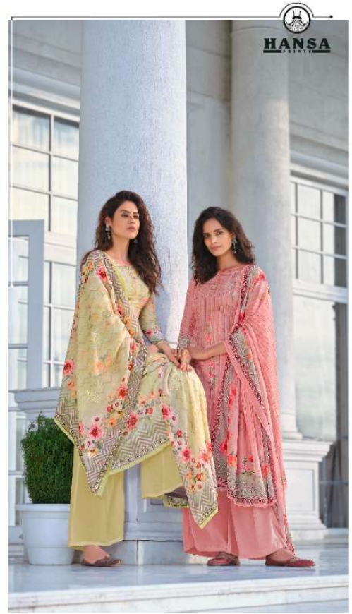
AN ECSTASY OF MATCHLESS PANACHE.