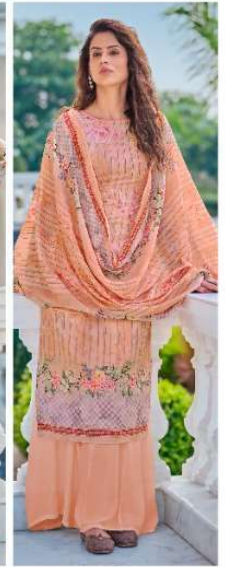
◆ 3106 ◆