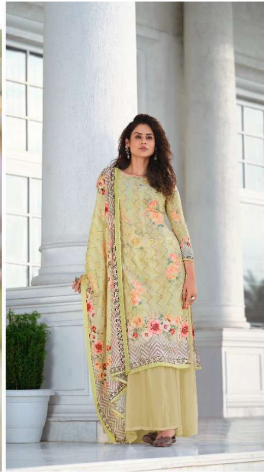
THE FEEL OF COMFORTABLE STYLE