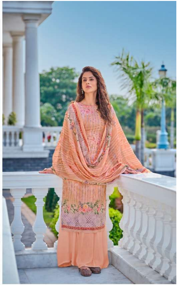
TIMELESS TREND OF THE NEW SEASON