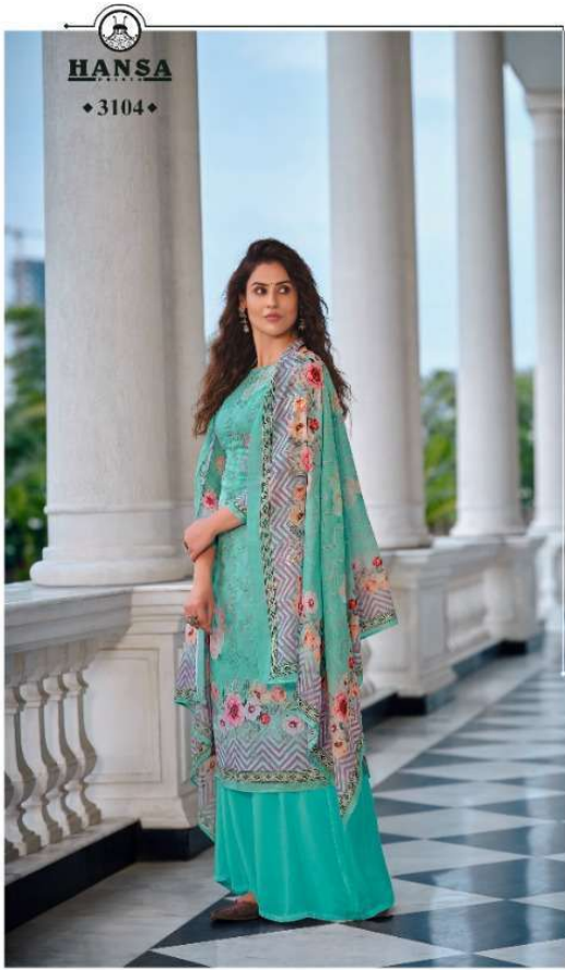
AN ESSENCE OF ETHNIC ESSENCE