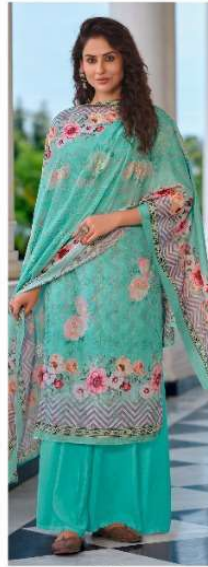
◆ 3104 ◆