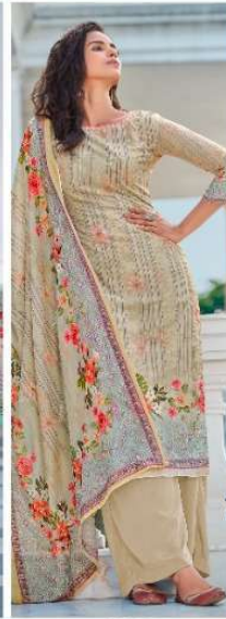
◆ 3105 ◆